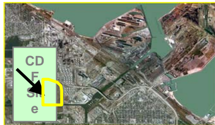
Indiana Harbor and Canal CDF

Of the planned RFPs, he foresaw unrestricted as well as small business set aside projects. He estimated that the District will award 20 contracts through September of 2007 totaling $50 to $75 million.