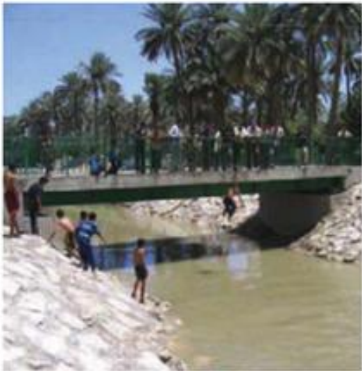
BRIDGE PLAY: Boys jump off a new bridge in Babil Province.

Come join us at the Highland Park Country Club (HPCC), which is a first-class conference facility where they serve an outstanding all-you-can-eat buffet lunch with several choices on everything from salads to entrees to desserts. Their combination of quality and variety makes this luncheon an enjoyable eating experience and an excellent value. Following lunch we will have a