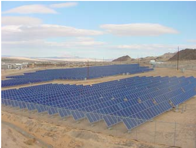
Photovoltaic Array 29 Palms, CA