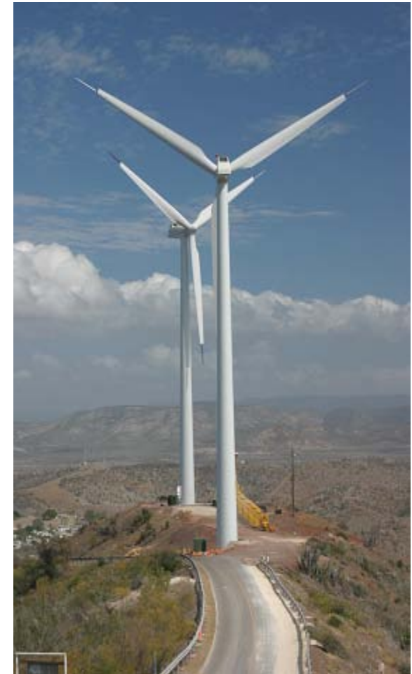
Wind Turbines Guantanamo Bay, Cuba